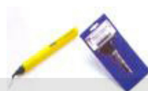
ESCAREADOR E CALIBRADOR