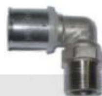
JOELHO ROSCA MACHO