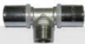
TÊ ROSCA MACHO