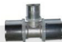
TÊ DE REDUÇÃO