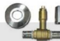
VÁLVULA DE CORTE