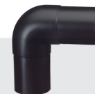
CURVA 90° PE 100 / PN 10

* fabricado c/ tubo sem soldadura (PN16)