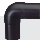
CURVA 90° PE 100 / PN 10

* fabricado c/ tubo sem soldadura (PN16)