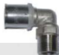
JOELHO ROSCA MACHO