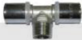
TÊ ROSCA MACHO