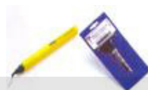
ESCREADOR E CALBRADOR