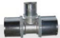
TÊ DE REDUÇÃO