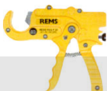
TESOURA CORTE REMS