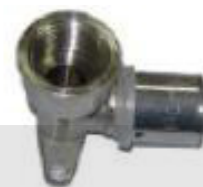
JOELHO COM PATÊR