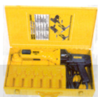
MÁQUINA DE CRAVAR REMS