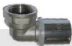
JOELHO ROSCA FÊMEA