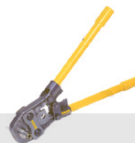
ALICATE ECO-PRESS REMS