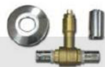
VÁLVULA DE CORTE