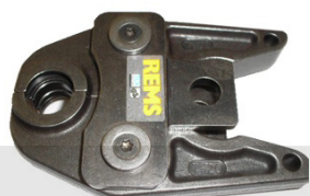
MATRIZ COM PERFIL U